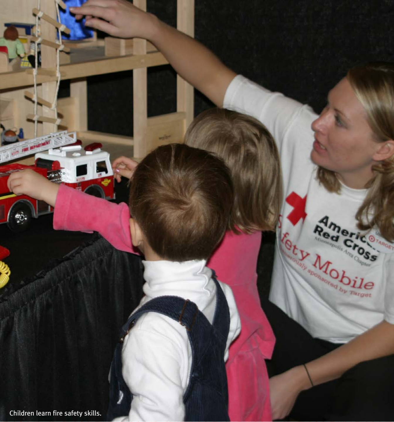
Children learn fire safety skills.