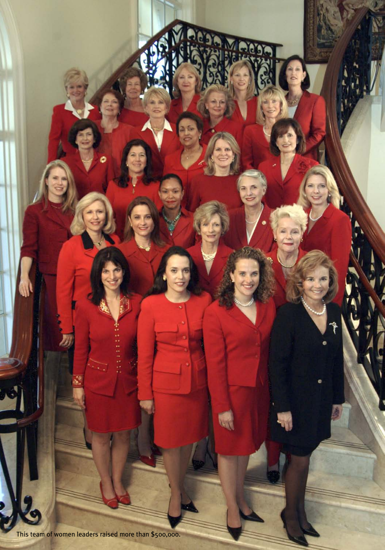
This team of women leaders raised more than $500,000.