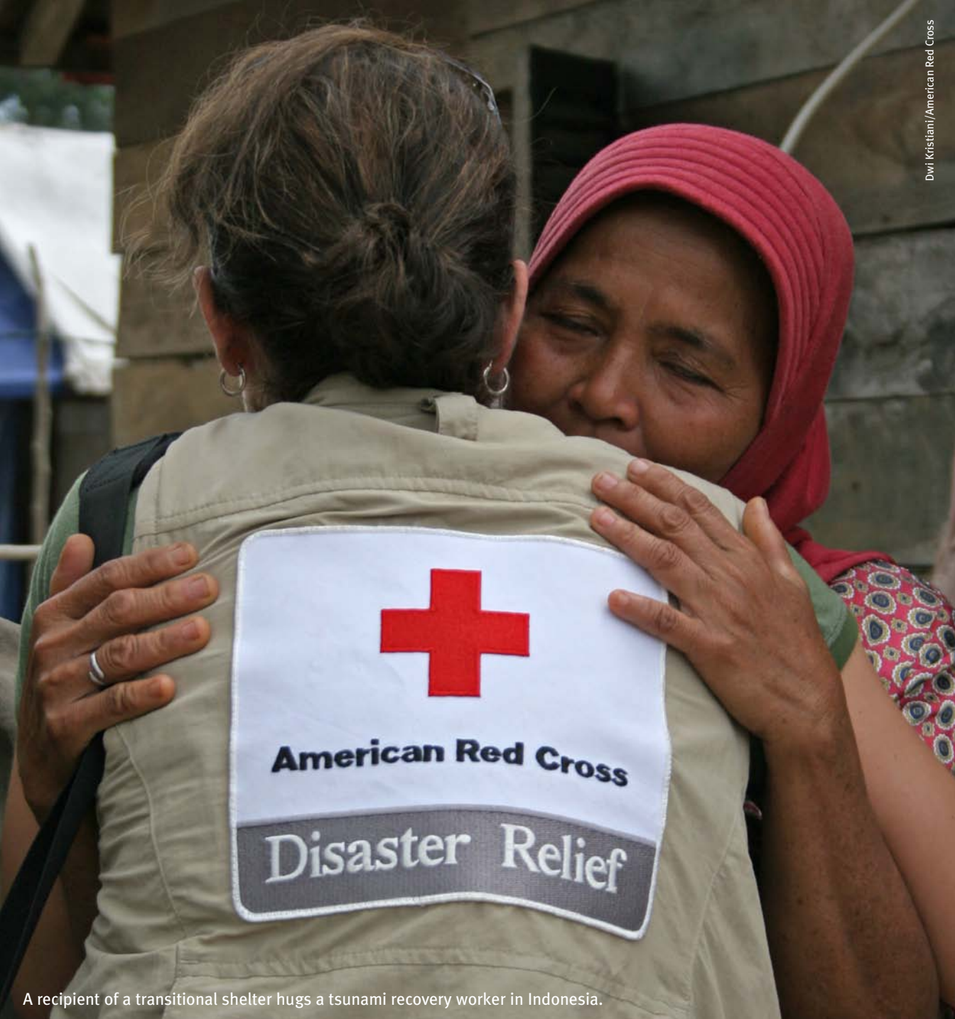
A recipient of a transitional shelter hugs a tsunami recovery worker in Indonesia.

Through the Measles Initiative, the American Red Cross has helped vaccinate 217 million children in more than 40 African countries, saving more than 1.2 million lives.